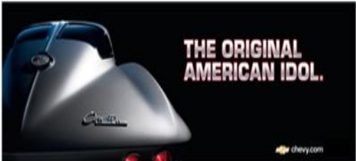
Chevrolet trademark(s) used with the written permission of General Motors.